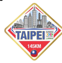
145KM Distance of Taipei from East to West