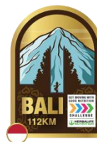
112KM Distance of Bali Island from North to South