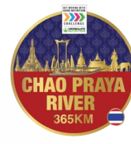
365KM Distance of Chao Praya River