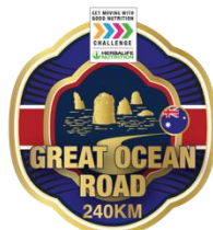
240KM Distance of the Great Ocean Road along the South Eastern coast of Australia