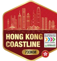
733KM Distance along the Hong Kong Coastline