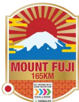
165KM Famous ultra-run trail in Mount Fuji