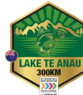
300KM Distant around Lake Te Anau in New Zealand