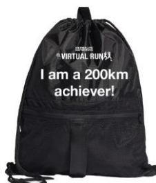
Drawstring Bag (Limited Units Only)