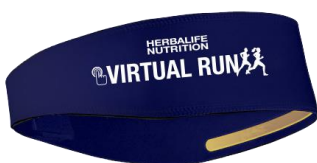
Reflective Running Sweatband (Limited Units Only)