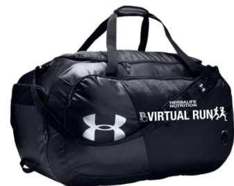
Under Armour Gym Bag (Limited Units Only)